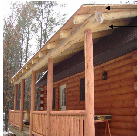
2 x 8 T&G Log rafters