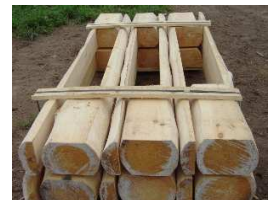
8" Double round extensions