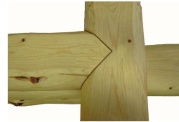
Top view of the V-cuts